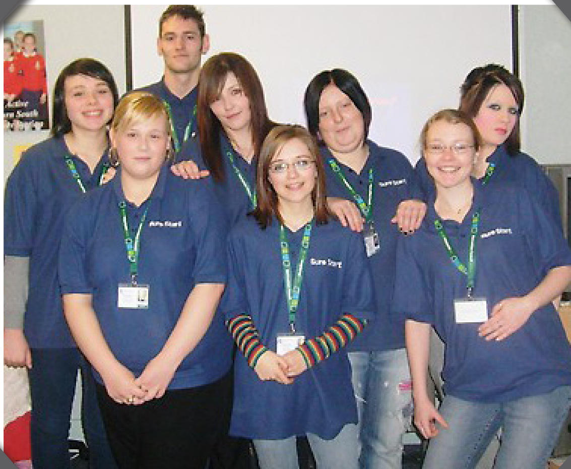
Our Peer Educators getting their volunteering awards in December 2009 at the Voluntary Sector Gateway, Bathgate